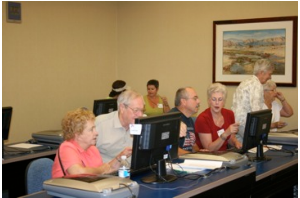
Pictured above are GCC members and their registrar helpers enrolling online at the fall class registration in October.